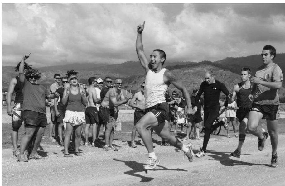
LCPL Ge leaps with glee leading the 100m heat

(More news from GYRO 13 in centre pages).