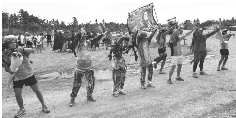
The PMV Tp leading Jamaica in the Opening Ceremony