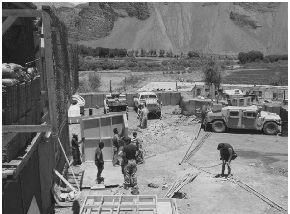
Engineers at work