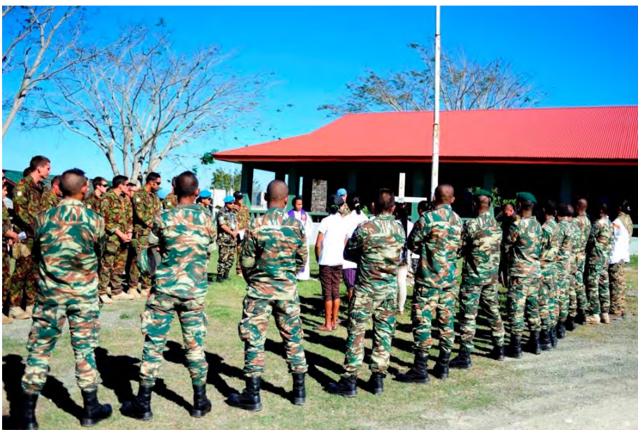
Tilomar Cova Lima Memorial Service

The NZ Contingent is currently planning to return to the COVALIMA Region later in the year to revisit these and our other memorial sites. This will provide an opportunity to remember the soldiers whose memory remains in this country and conduct some needed preservation maintenance to each site as we look to leave Timor-Leste in the New Year.