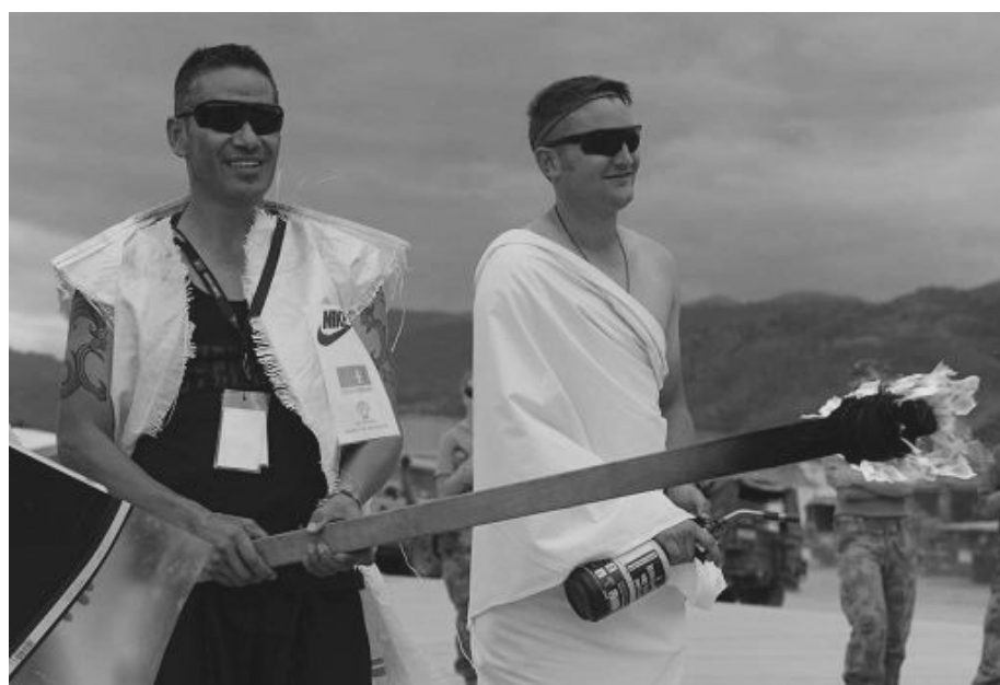
The OC prepares to light the Olympic Rings