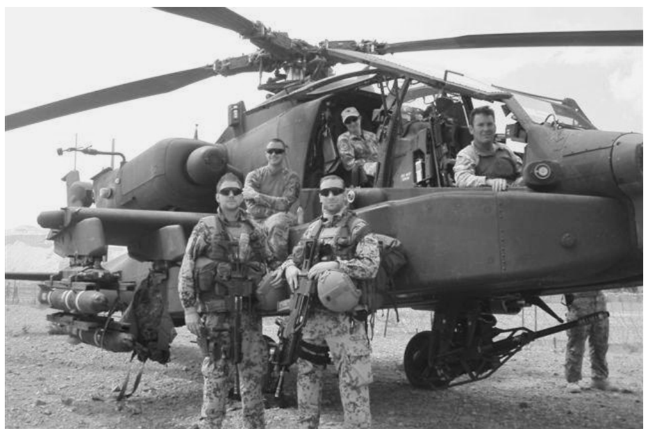
Kiwis, Germans and Americans with an Apache helicopter — 1 of the 6 helicopters that arrived as part of the German Ministers escort

Over the past few weeks we have had an inordinate amount of visitors to the PRT, all with their own unique demands. On most days there are more people from other countries than there are New Zealanders in Kiwi Base, and whilst this can be trying at times, the positive side is we get to meet a lot of interesting and powerful people and hopefully provide them with a positive impression of the NZDF and Kiwis in general. The last visitor was the German Minister of Defence who arrived with 6 helicopters and an entourage of 28. The Germans have pledged 600 million euros in aid to Afghan over the next few years, so it was a great opportunity to have them here