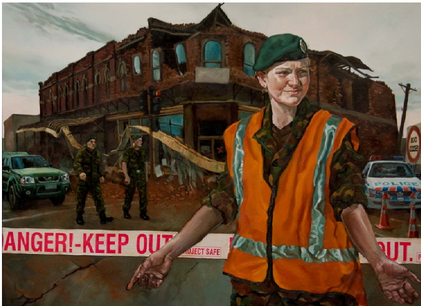
Christchurch Earthquake Patrol

With no entry fee (donations to the museum kindly received) we hope you will enjoy the exhibition, and return more than once.