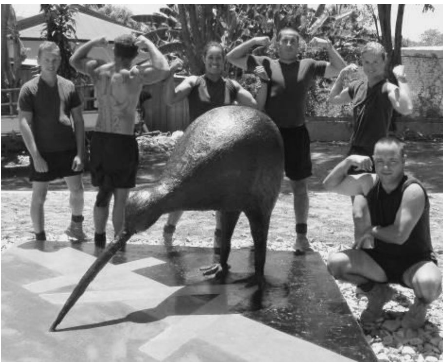
The Suai Kiwi