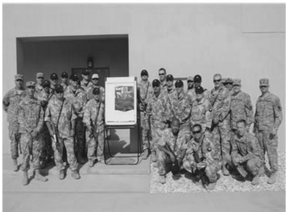
NSE 16, NSE 17 and American representative personnel