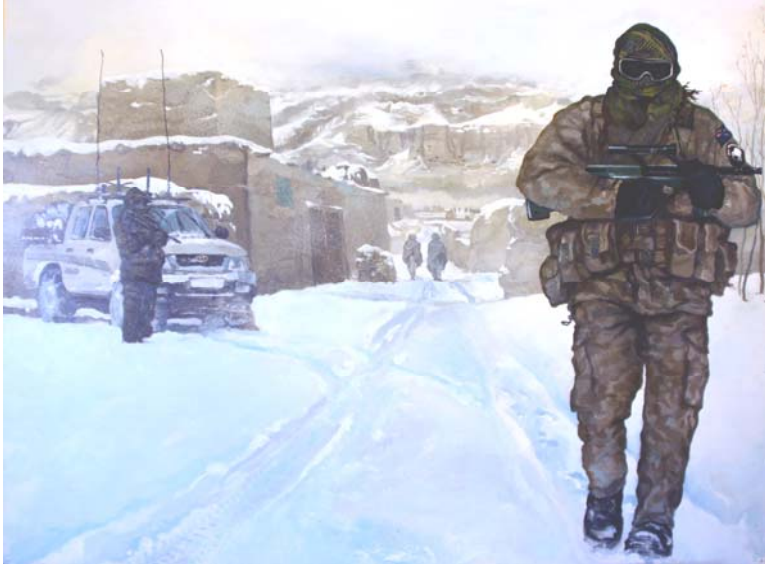
Winter Patrol (Crib 11)