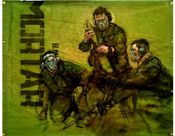
Mortar in Action

Those who have served with a winter rotation in Afghanistan will recognise this scene..