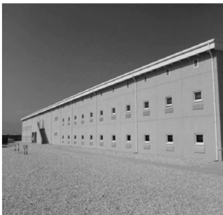
The new barrack complex now named O'Donnell Hall

It was a moving parade for all those present and one that will be remembered for a long time to come.