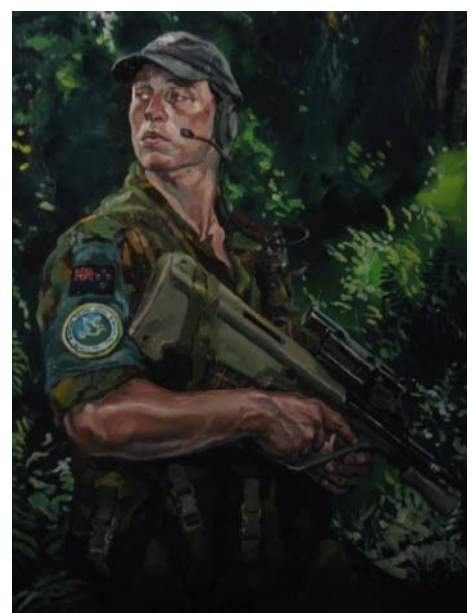
Deployment in the Solomon Islands Oil on canvas