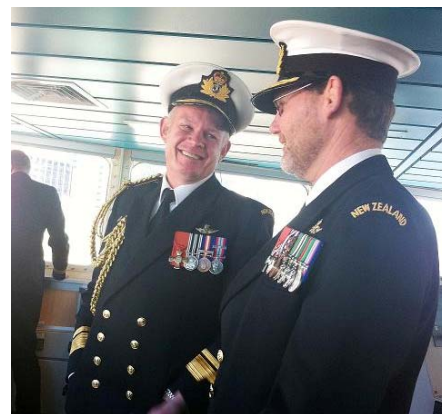
VCDF with MCC on board the new OPV HMNZS Wellington on her first visit to her homeport Wellington

That brings me on to the changes that are underway in the NZDF and the reason why change is essential. Gen Shinseki, the then Chief of Staff of the US Army, responded to a group of officers who were